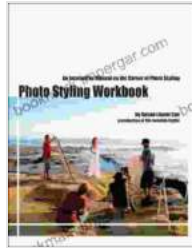
Photo Styling Workbook