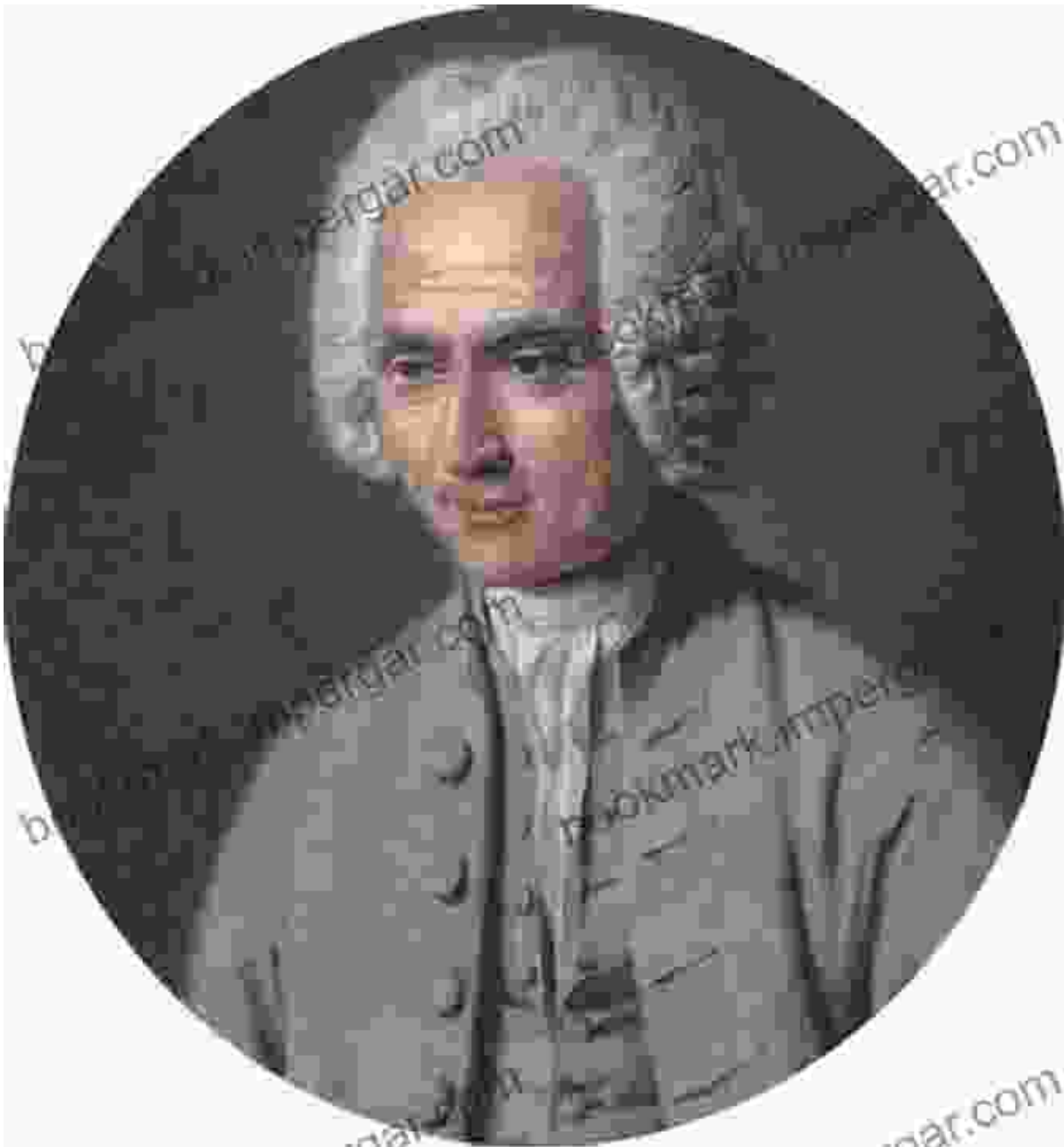
Jean-Jacques Rousseau, a prominent liberal thinker

One of the most influential liberal thinkers of the Romantic Age was Jean-Jacques Rousseau. Rousseau argued that all people are born free and equal, but that society has corrupted them. He believed that the best government would be one that reflected the will of the people, which could be determined through direct democracy.