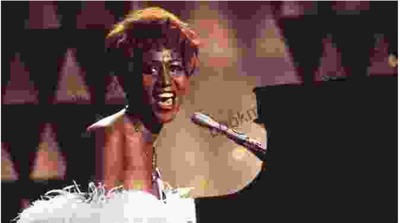
Aretha Franklin performing in the 1970s