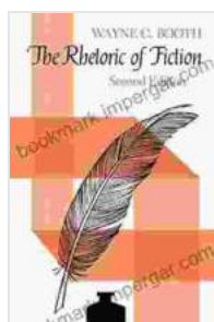
Image Alt Text: Front cover of Wayne Booth's "The Rhetoric of Fiction" featuring a pen nib writing on a piece of paper.

For anyone seeking to deepen their appreciation of literature, to master the art of literary analysis, or to explore the complexities of communication, "The Rhetoric of Fiction" is an indispensable resource. Its timeless wisdom continues to inspire generations of readers and scholars, empowering them to unlock the secrets of the written word.