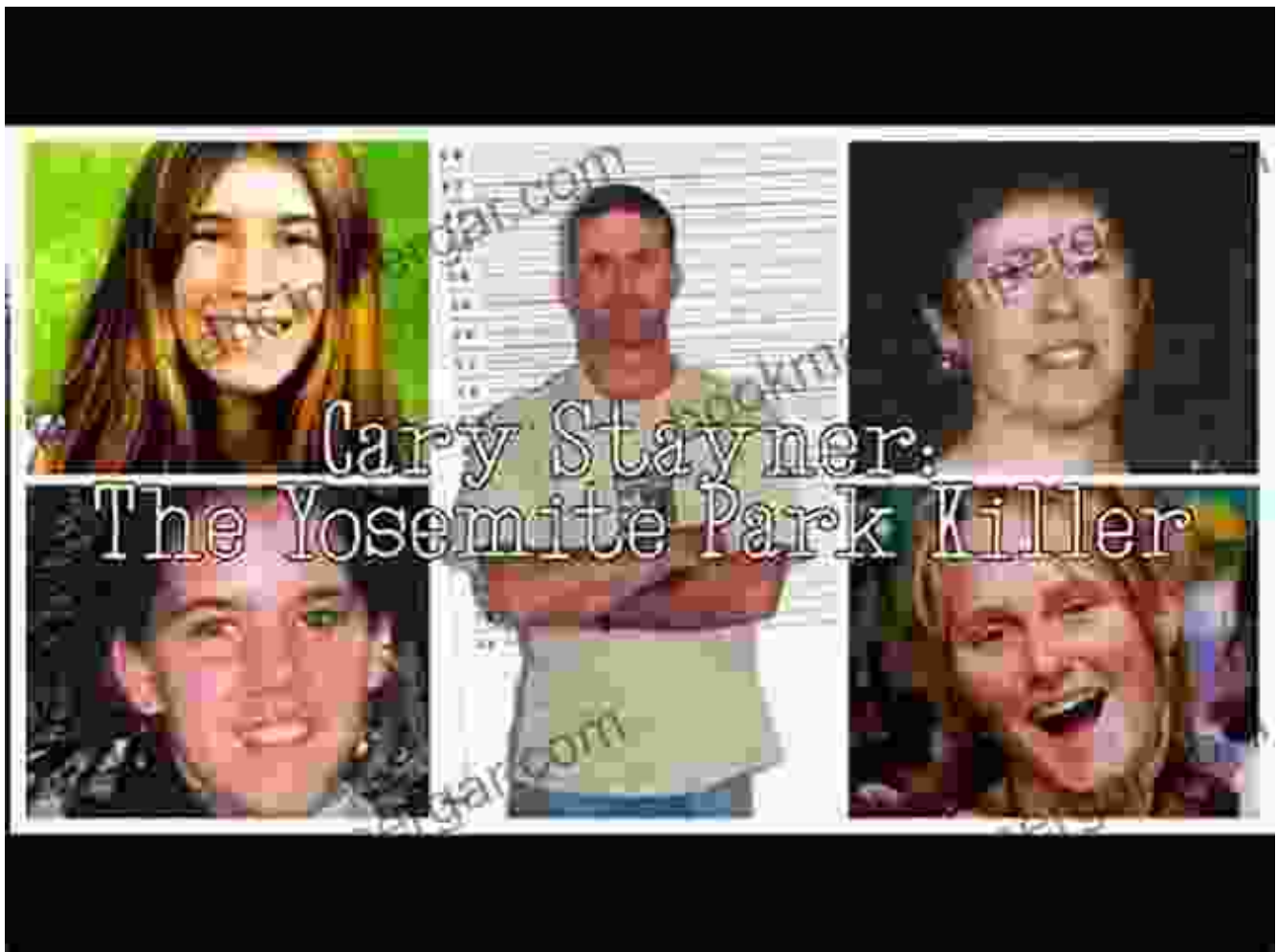
Composite sketch of Cary Stayner

Free Download your copy today and immerse yourself in the harrowing true story that shook Yosemite National Park to its core.